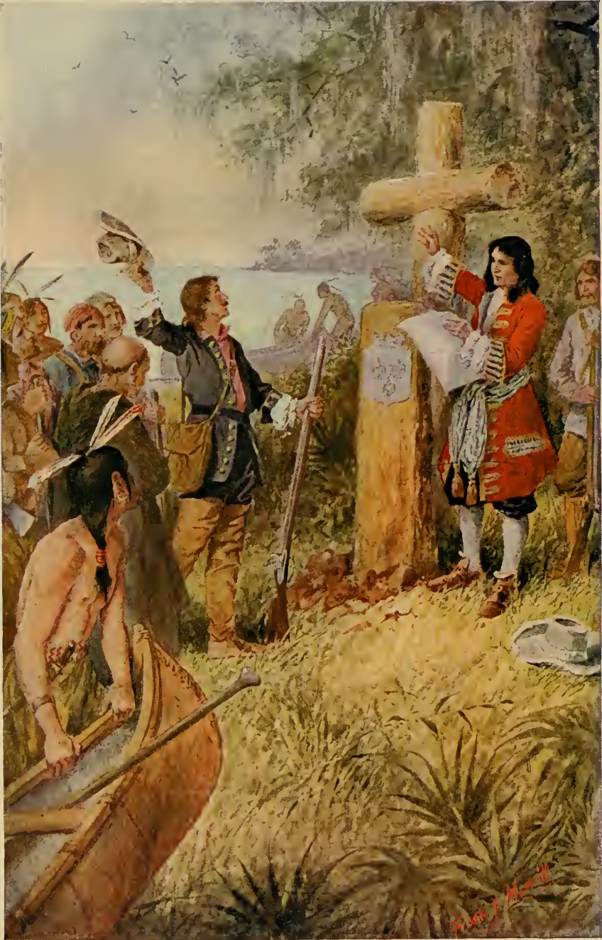
LA SALLE TOOK POSSESSION IN THE NAME OF THE KING OF FRANCE (p. 187)